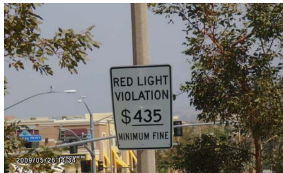
Minimum Fine signage in the City of Santa Clarita