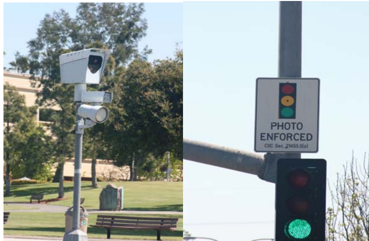
Typical Red Light Camera installed in Ventura

Driving through a red traffic light is an infraction of the law 1 and is a violation of California Vehicle Code § 21453. Traditionally, enforcement of this code has been by traffic enforcement officers employed by a local police agency.