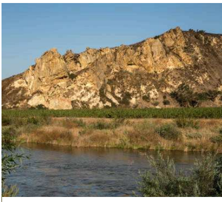
FLOOD ZONE 4 NORTH (CUYAMA RIVER)