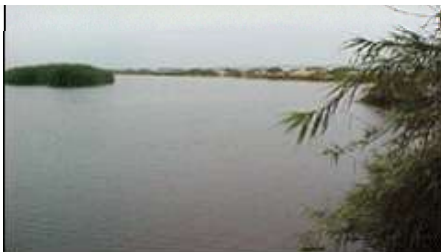
SANTA CLARA RIVER