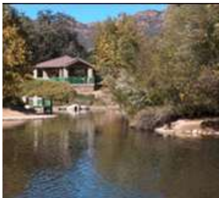
FLOOD ZONE 4 SOUTH