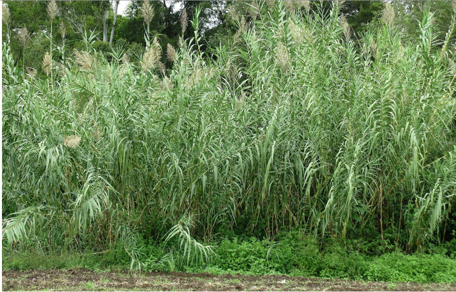
ARUNDO DONAX Arundo is a head-high grass that chokes out the native plants which hundreds of animals depend on for food and shelter.