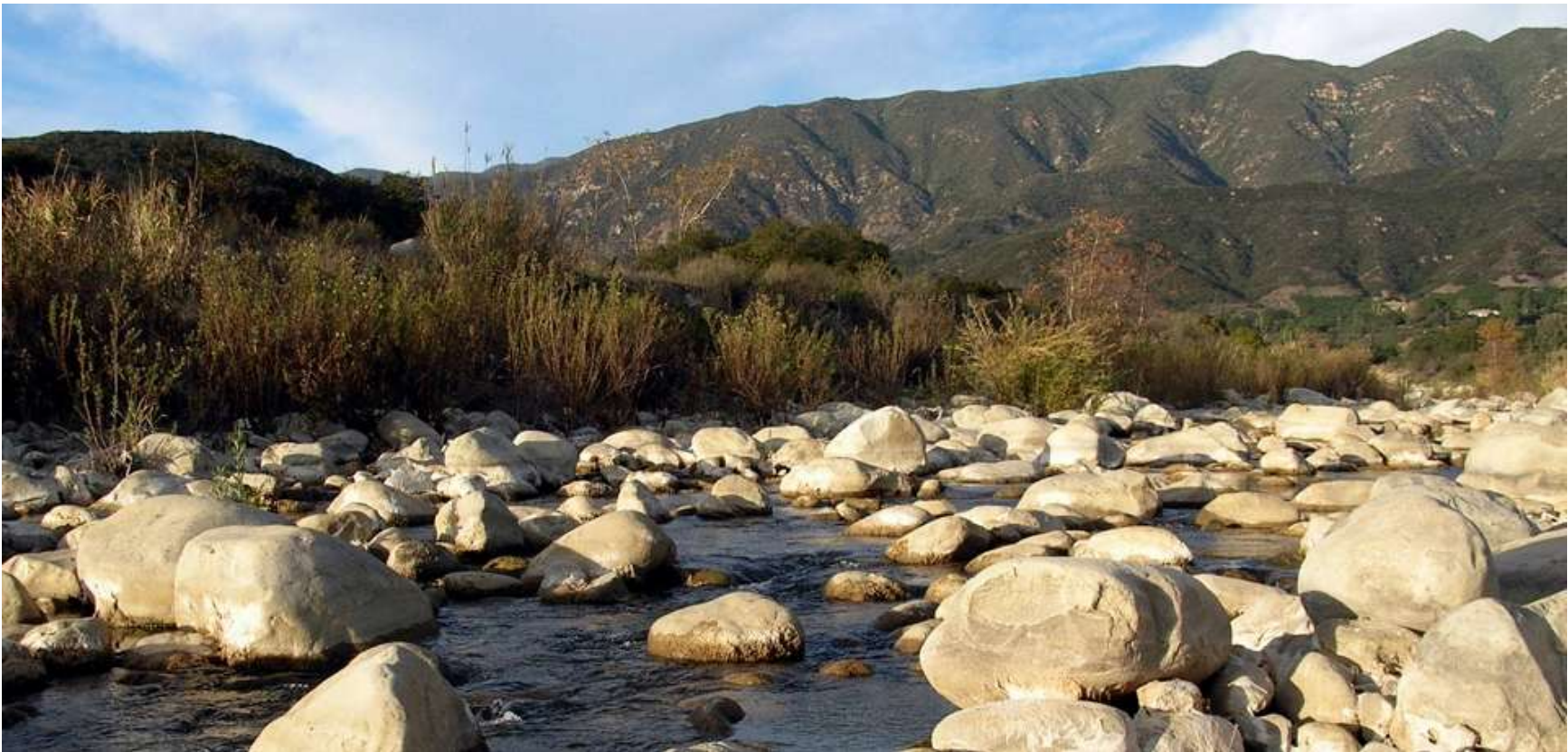
Ventura River Watershed Council

Ventura County Coalition of Labor, Agriculture and Business ( http://www.colabvc.org/ )