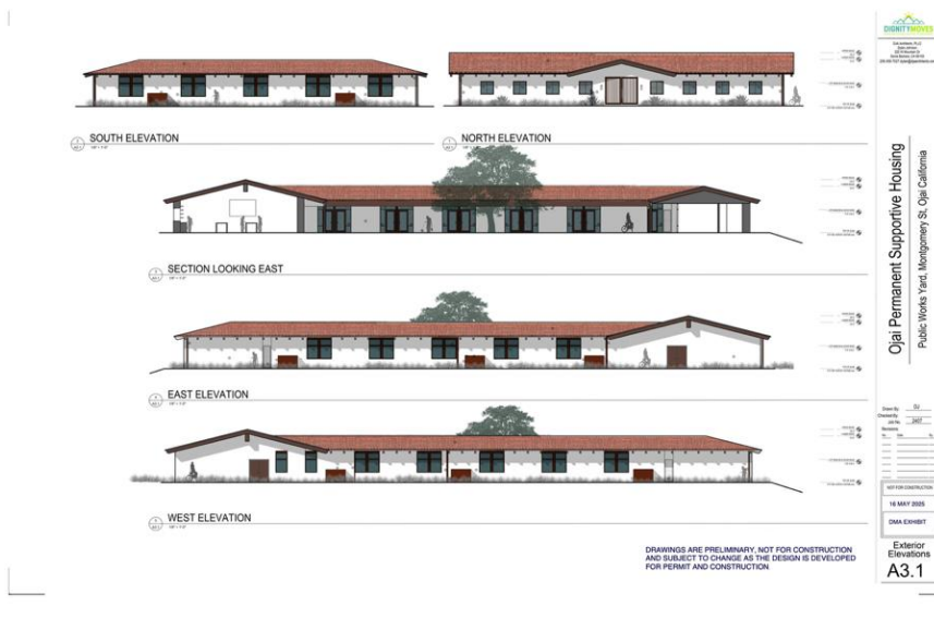
Figure 3: Ojai Permanent Supportive Housing Preliminary Design.