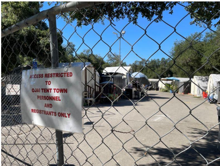
Figure 1: Current Ojai Tent Town. ( Att-002 )

According to Ojai's website, "The City has experienced people camping on the City Hall Campus since early 2019. To address this issue and community concerns, the City temporarily created the tent town on the City Hall parking lot adjacent from Kent Hall. The City is interested in a long term solution to address the housing crisis in Ojai. To do so, the City plans to turn part of the southern portion of the City's Public Works Department's Maintenance Yard into a permanent supportive housing site, described as the Cabin Village. Preliminary plans for the Cabin Village project include up to 30 units assembled in a 'Mediterranean Village' format equipped with a centralized courtyard, and communal facilities in a cooperative living environment, which may include a resident stewardship program to maintain the Cabin Village." ( Ref-002 )