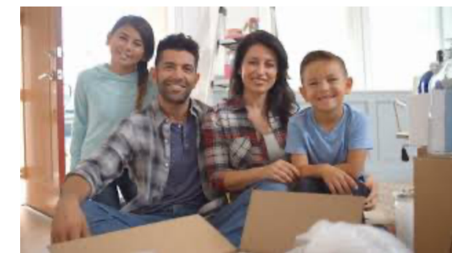
Ventura County Coordinated Entry System CES Pathways to Home

The following videos are available to those who would like to learn more about the VC CoC programs: