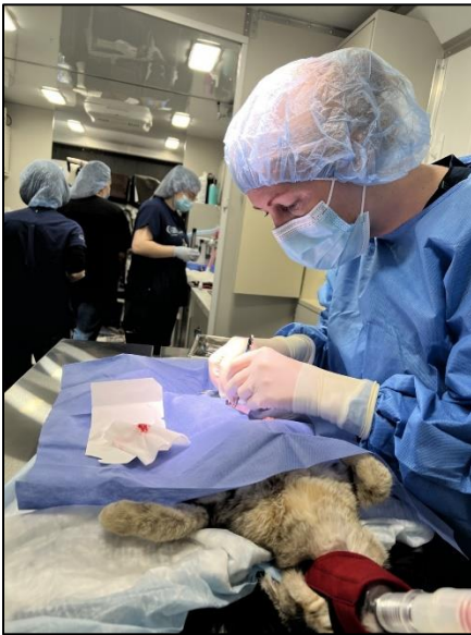
Exhibit 1: Mobile Vet Clinic (Photos provided by Ventura County Animal Services 3/4/2026)